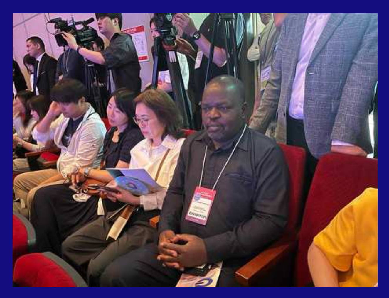
SEPU CEO during his visit to South Korea