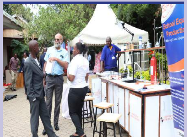
SEPU's booth during KPSA directors (Western Chapter ) forum in Bungoma