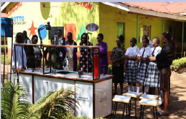
A demonstration after delivering a mobile lab and an intergrated science kit at Kimuchu Primary and Junior Secondary in Thika Makongeni