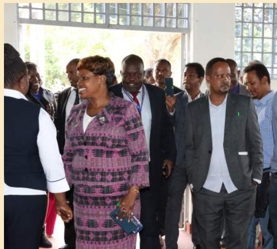
With the Ethiopian Delegates at SEPU showroom