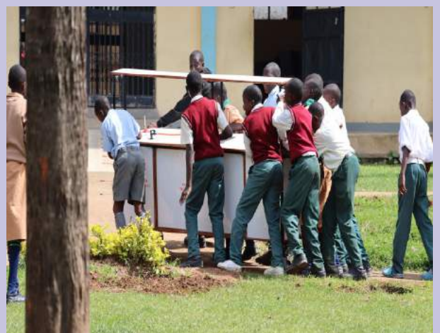
Excited students of St. Ann Lubao wheel their newly acquired laboratory bench