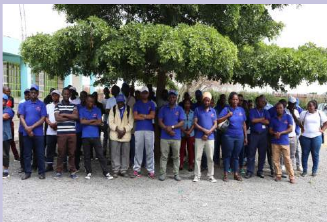
SEPU team during tree planting day at Nabeel Intergrated Boys High school