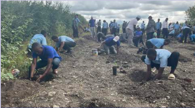
CSR at Nabeel Integrated High School

Pursuant to the Presidential directive of planting 15 (fifteen) billion trees by the year 2023 and the expectation of SEPU performance contracting, SEPU team on May 31st, 2023 planted 300 trees at Nabeel Integrated School in Tala, Machakos county in fulfilment to the Presidential directive.