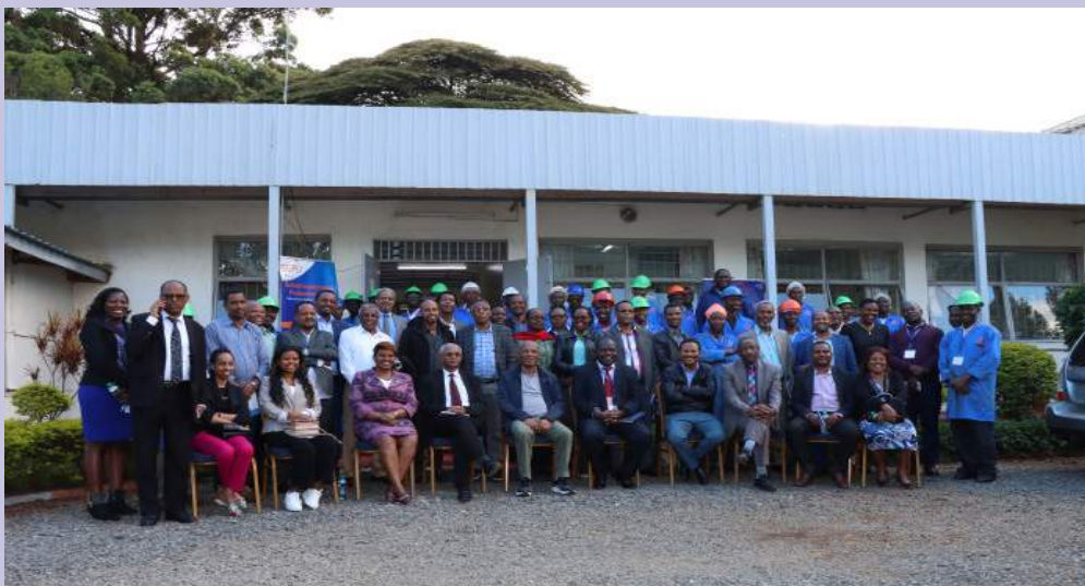
Ethiopian Delegates pause for a photo with SEPU Production team