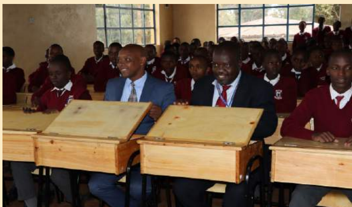
CEO /Managing Director at Karai Mixed Secondary in Kikuyu Constituency , Kiambu county.