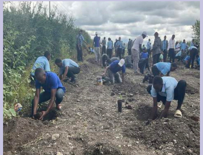
Tree planting activity at Nabeel Integrated High-school in Tala, Machakos county