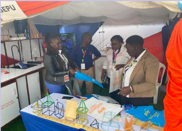
SEPU's booth during the 46th KESSHA conference in Mombasa