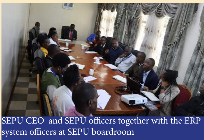
SEPU CEO and SEPU officers together with the ERP system officers at SEPU boardroom