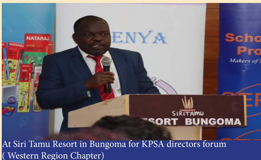
At Siri Tamu Resort in Bungoma for KPSA directors forum ( Western Region Chapter)