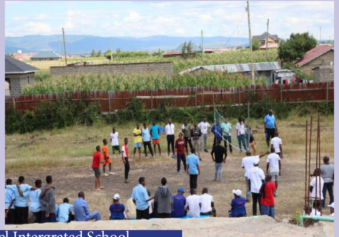
Team Building at Nabel Intergrated School