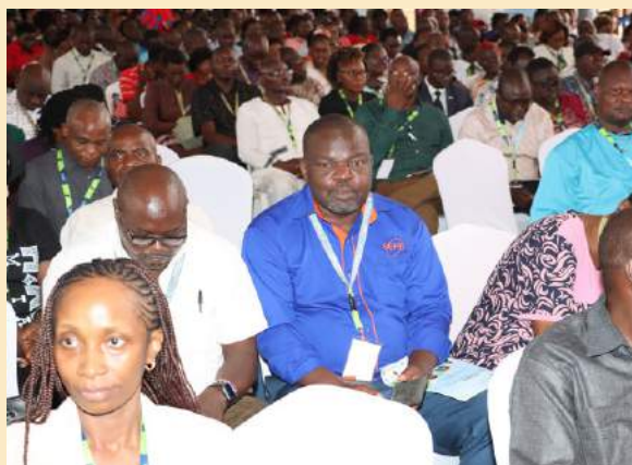
SEPU CEO in Mombasa for 46th KESSHA conference