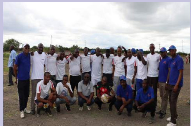
SEPU football team during a Corporate Social Responsibility activity in Tala, Machakos county